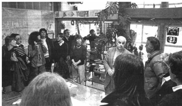
A foreign delegation visiting the Diana School