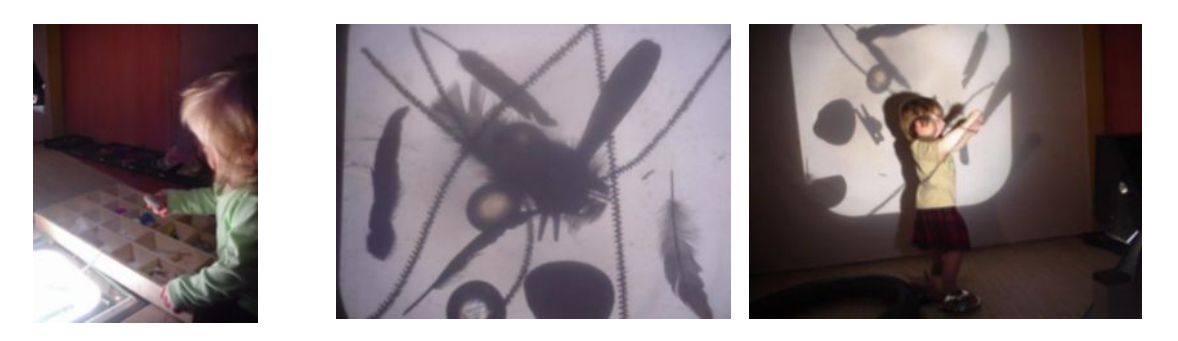
Hope creates an image on the screen, and Asa dances slowly in front of it